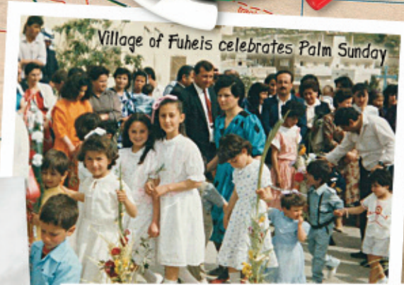
Village of Fuheis celebrates Palm Sunday