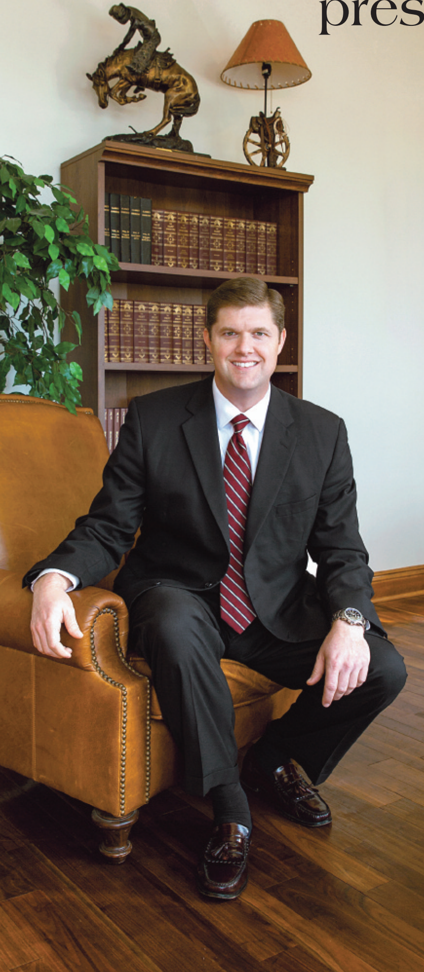
IMAGE OF GOD